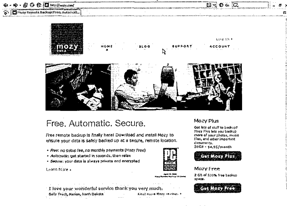
FIGURE 1 Mozy home page

That is, the basic version is free. Any Web user can log on to the Mozy site, at http://www.mozy.com , book themselves two gigabytes of space on the resident server, and download the Mozy program on to their own hard system. Running the program allows the user to specify what files they want to back up – by type (ie file extension), date or location, or any combination of these – and when they want to back them up. Having done this, the user sits back and lets Mozy handle the rest. Users who need more than 2Gb of storage are able to subscribe to a Mozy Plus account for between US $1.95 and US $9.95 per month, giving them between 5Gb and 60Gb of storage space.