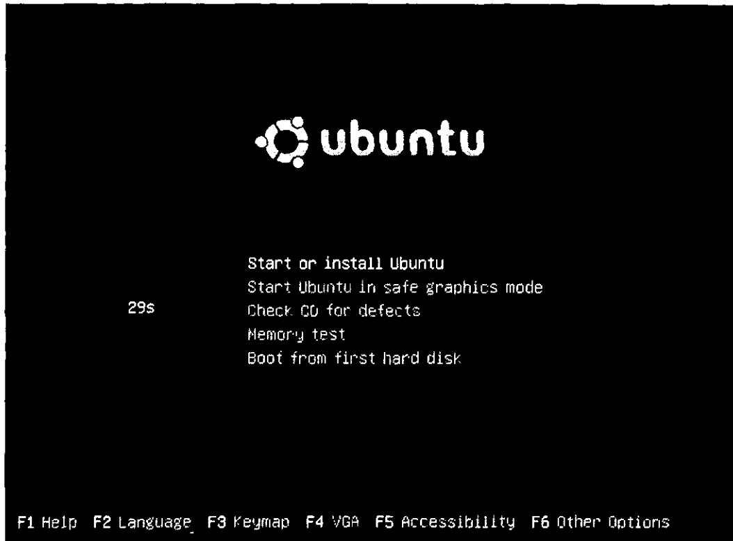
FIGURE 2 Installing Ubuntu

I installed Ubuntu twice, on to two different hard disks on an older Pentium II PC with 32Mb of memory. The first installation went without a hitch; the second stopped and had to be restarted, after which it proceeded with no further problems. In half an hour I had a working Linux installation with a full complement of file management programs, a word processor, spreadsheet and database, a working connection to the internet and a functioning web browser. I added the Mozilla Thunderbird email manager from a repository and the Adobe Reader program from the Adobe site – both free – and had pretty much everything I needed for my daughter to do her schoolwork, play games and browse the internet. A network connection with the two Windows-based computers in the house worked partially – I could see them and access their disks from Ubuntu, though they couldn't see me. Connecting to the Canon network printer, though possible in theory, went into the “too hard” basket; however, since most Linux programs can “print” to PDF files, I can just send these over the network and print them from one of the PCs.