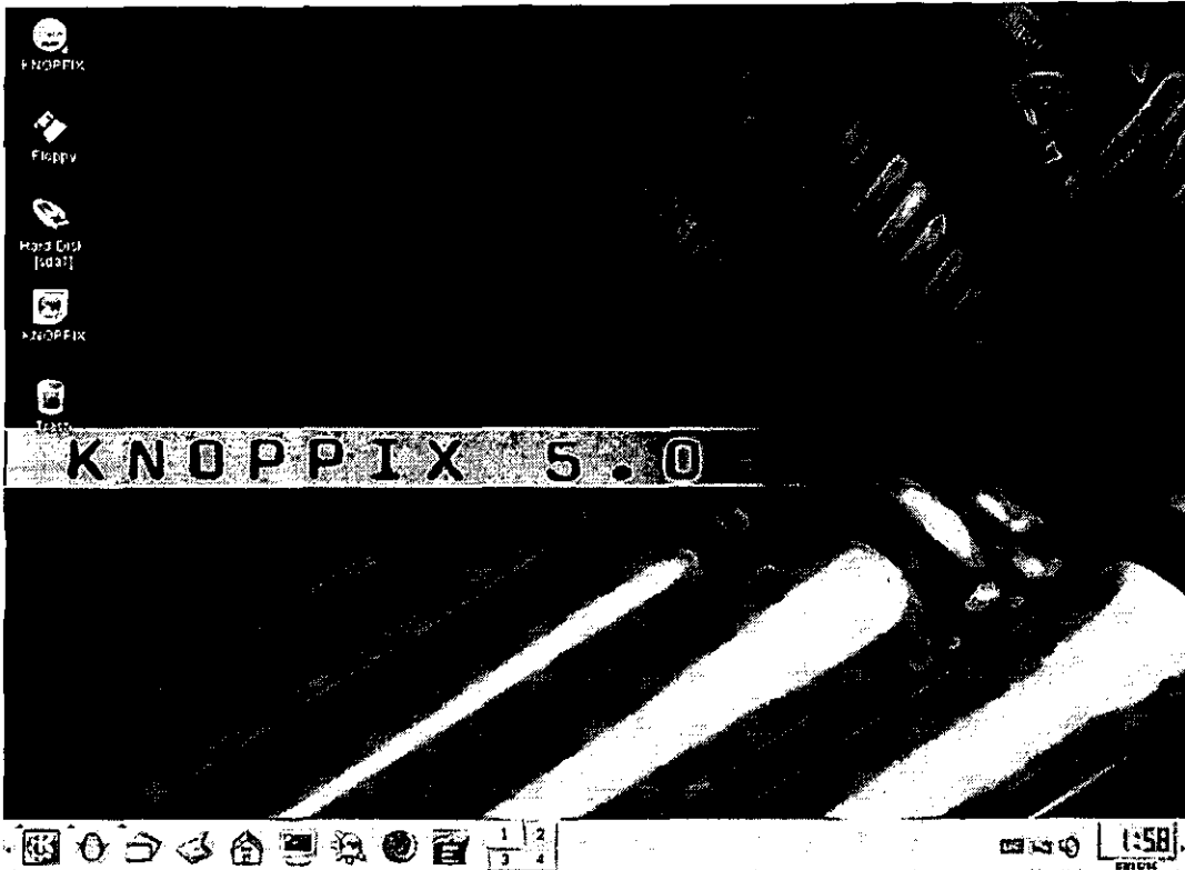
FIGURE 1 Knoppix 5.0

As well as providing a user-friendly demo, Knoppix can also be used to virus-proof a PC during a web session: if you're browsing into territory you think might result in hostile downloads, then booting up with Knoppix guarantees that nothing gets written to your hard disk. For that reason, it's also a good environment for children to play around in. Knoppix can be installed on to a hard disk, but that's not really what it's designed for. If you want to switch a system over to Linux permanently, it's better to have a distro designed for this purpose. Meanwhile other Linux systems are jumping on the Knoppix bandwagon including Kate OS ( http://kateos.org ).